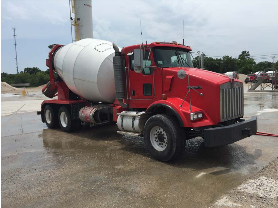
**REPRESENTATIVE PHOTO. ACTUAL TRUCK MAY BE DIFFERENT

Tel: 817-764-1066 Fax: 817-416-9200 1-888-886-4937