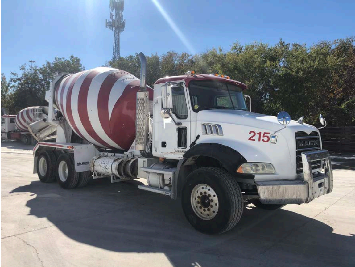
**REPRESENTATIVE PHOTO. ACTUAL TRUCK MAY BE DIFFERENT

Tel: 817-764-1066 Fax: 817-764-1072 1-888-886-4937